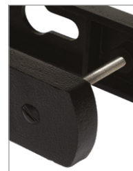
Stainless Steel Fixing