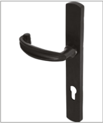
TMB Textured Matt Black