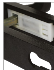
HD Spring Cassette