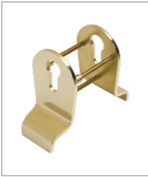
PPB Polished Brass - PVD Stainless Steel