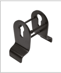
MSB Matt Smooth Black