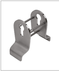
SSS Satin Stainless Steel

Visit www.coastal-group.com for CAD drawings