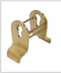
PSB PVD Satin Brass