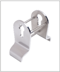
PSS Polished Stainless Steel