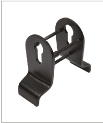
TMB Textured Matt Black