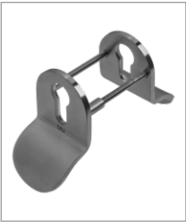
SSS Satin Stainless Steel

Visit www.coastal-group.com for CAD drawings