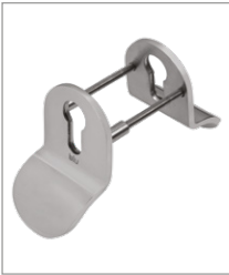
PSS Polished Stainless Steel