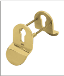
PPB Polished Brass - PVD Stainless Brass