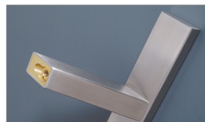
Brass bush fixing ferrules to prevent handles from coming loose