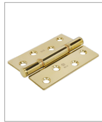
PPB PVD Polished Brass