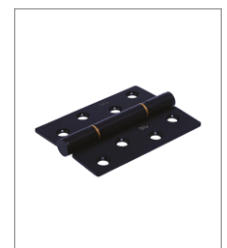
MSB Matt Smooth Black

Note: Matt Smooth Black, White & Oil Rubbed Bronze hinges are not supplied with fixings you need to use code FX-RHF530