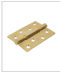
PSB PVD Satin Brass