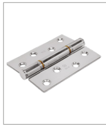
PSS Polished Stainless Steel