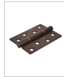
ORB Oil Rubbed Bronze