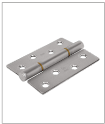
SSS Satin Stainless Steel