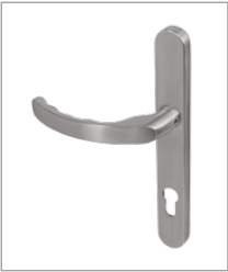
SSS Satin Stainless Steel

Visit www.coastal-group.com for CAD drawings