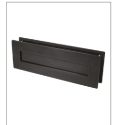
PBK PVD Satin Black