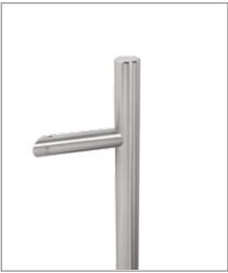
SSS Satin Stainless Steel

Visit www.coastal-group.com for CAD drawings