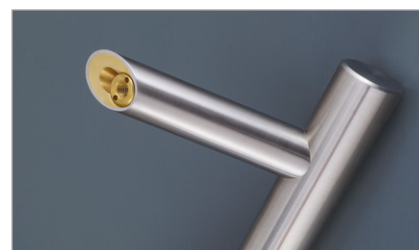
Brass bush fixing ferrules to prevent handles from coming loose

T 01726 871 025 E sales@coastal-group.com W coastal-group.com