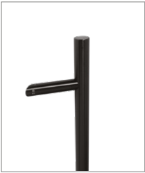
PBK PVD Satin Black